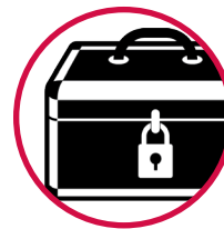
A tackle box with a lock