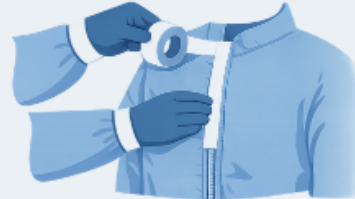
Tape portals of entry

For personnel at risk of exposure to contaminated liquids: